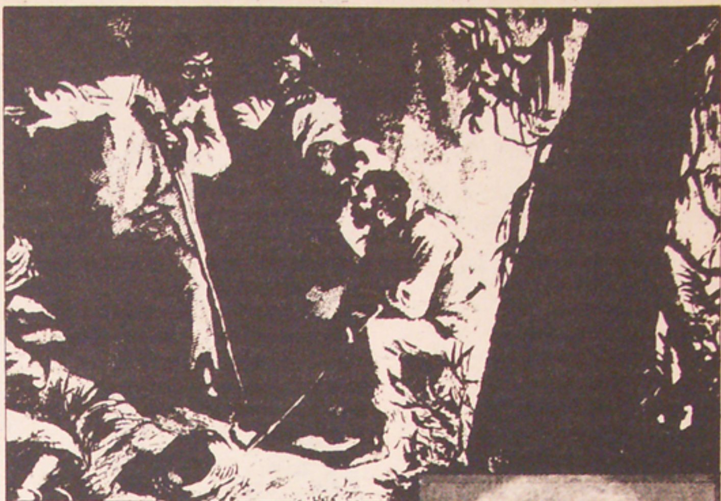
Artist's conception of the planning of the famous Nat Turner slave rebellion FREDERICK DOUGLASS (right).

This Fourth of July is yours, not mine. You may rejoice, I must mourn. To drag a man in fetters into the grand illuminated temple of liberty, and call upon him to join you in joyous anthems, was inhuman mockery and sacrilegious irony. Do you mean, citizens, to mock me, by asking