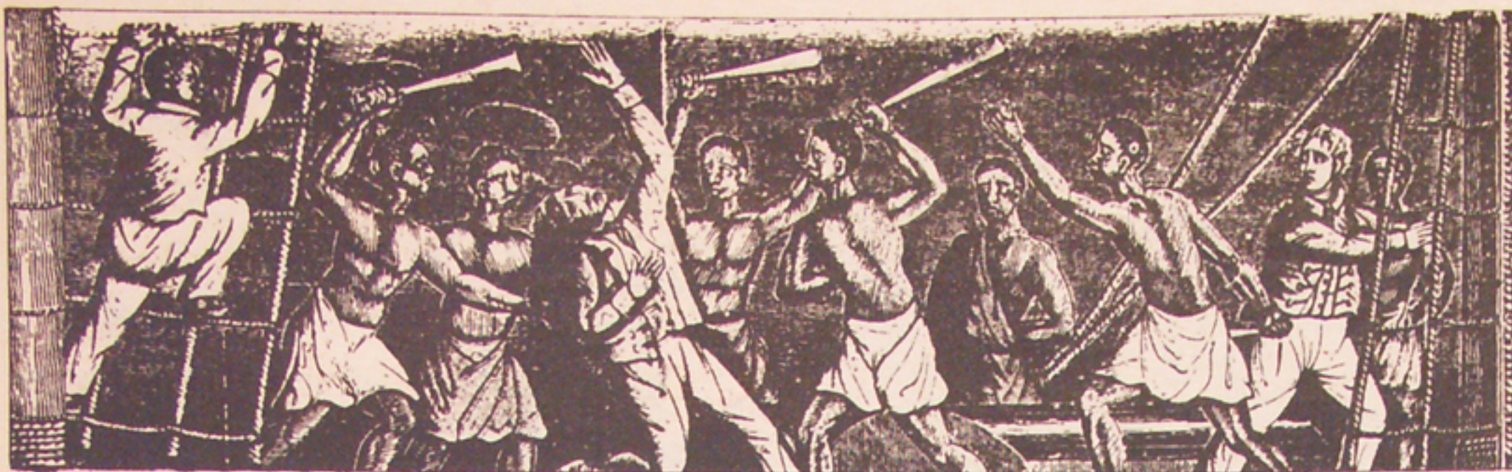
Artist's conception of kidnapped Africans rebelling on a slave ship.