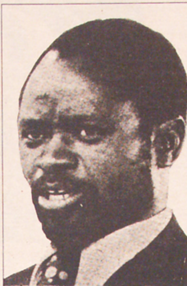
Mozambican President SAMORA MACHEL (right). BPP President HUEY P. NEWTON met the FRELIMO leader in China in 1971.

We only have to remember the words of the Cardinal Archbishop of Lourenco Marques, when he said, referring to the role of colonial education: "Schools, yes, schools that teach