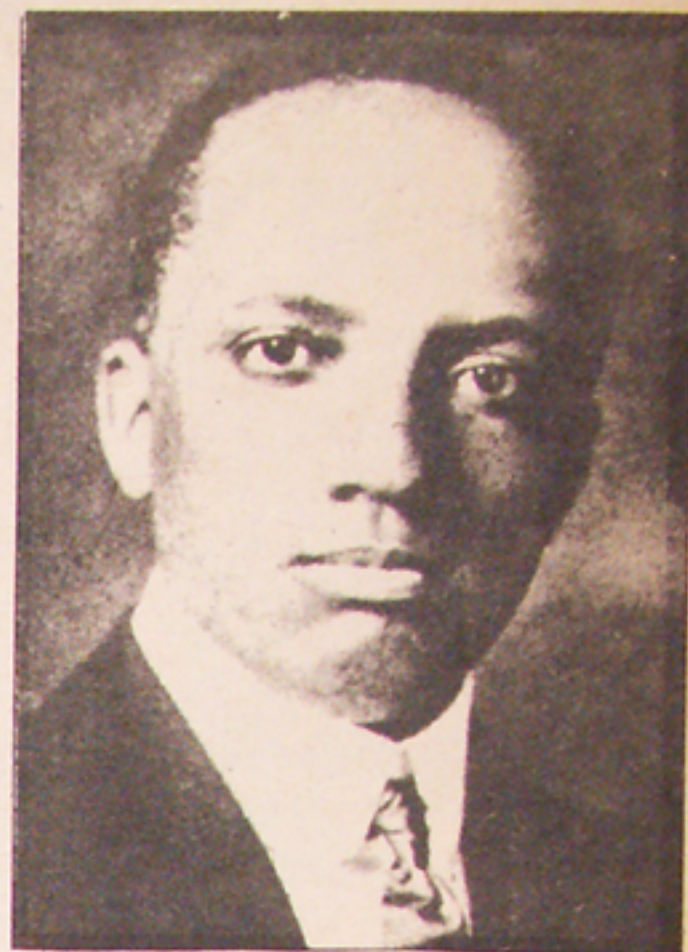
Early picture of Dr. CARTER G. WOODSON, the founder of Black History Month.

In February, 1926, Woodson founded Black History Week, which today has become Black History Month. The young