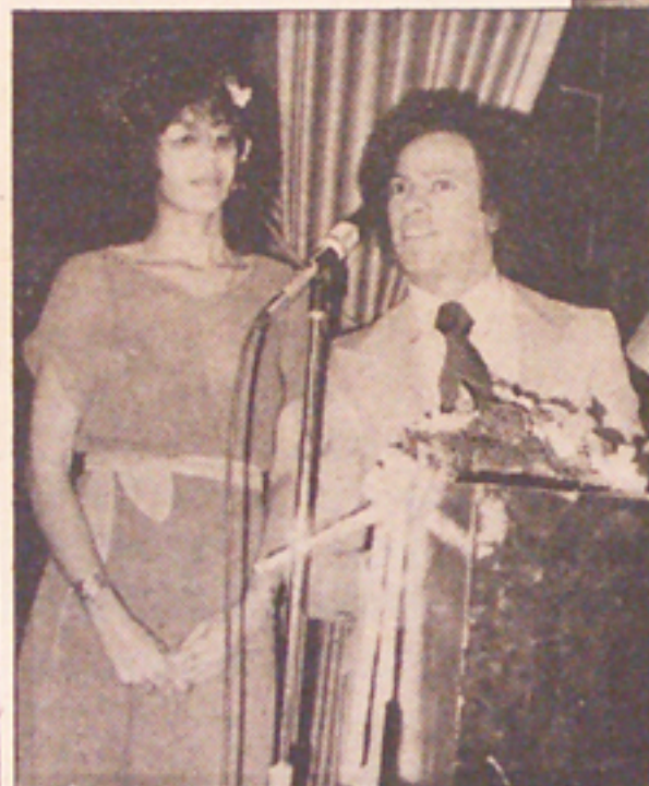
(Oakland, Calif.) - Black Panther Party President HUEY P. NEWTON (left) was presented with a plaque by Oakland Community School Director ERICKA HUGGINS (far left) on his 37th birthday on February 17 at a testimonial dinner honoring Oakland Community Learning Center's (OCLC's) eighth anniversary. Children from the Oakland Community School (OCS) performed the play the Wiz (top) and participated in a Black History Bee.