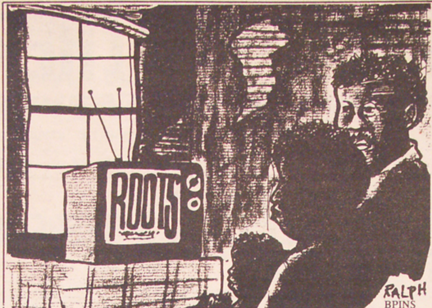
History? Baby, Them White Folks Ain't Stopped Treating Us Like That!

Black history has been "lost," stolen and destroyed. We must do all in our power to ensure that our children will have the knowledge of themselves that will help them lead America and the world to freedom. □