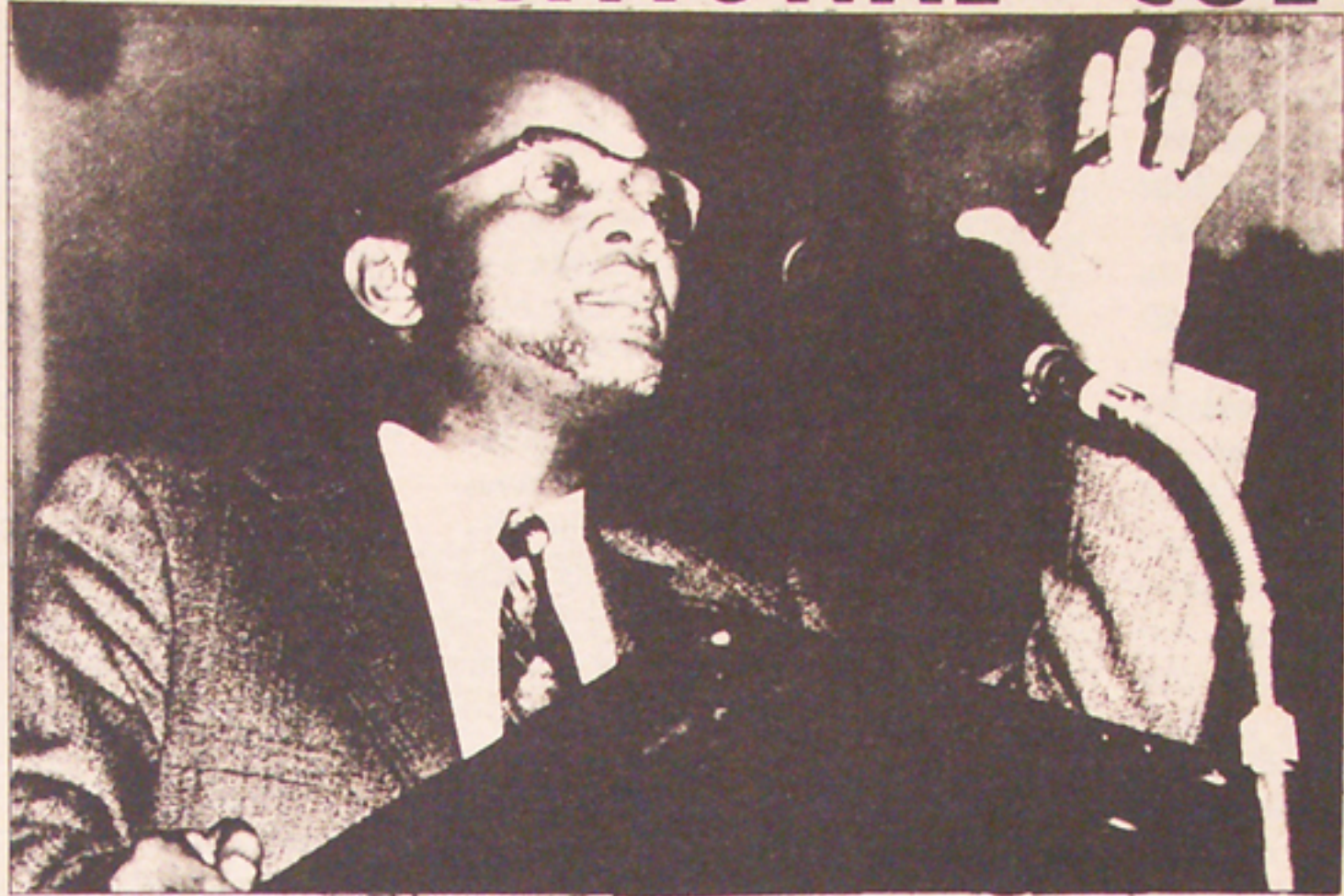
Assassinated secretary general of the African Party for the Independence of Guinea and the Cape Verde Islands, AMILCAR CABRAL.

These practical examples give a measure of the drama of foreign imperialist domination as it confronts the cultural reality of the dominated people. They also suggest the strong, dependent and reciprocal relationships existing between the cultural situation and the economic (and political) situation in the behavior of human societies.