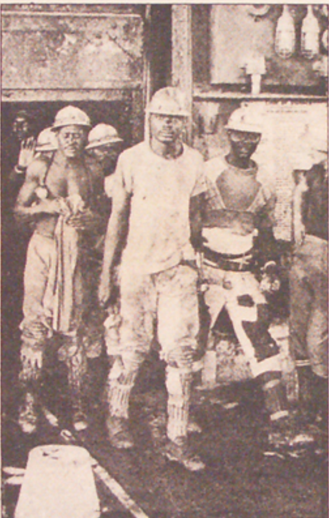
Black South African gold mine workers are exploited by the U.S. and the South African government.

The nature of the "unrest" is not specified, so by its ambiguity it implies that the South African regime has permission to control production even in the event of a peaceful demonstration or a strike.