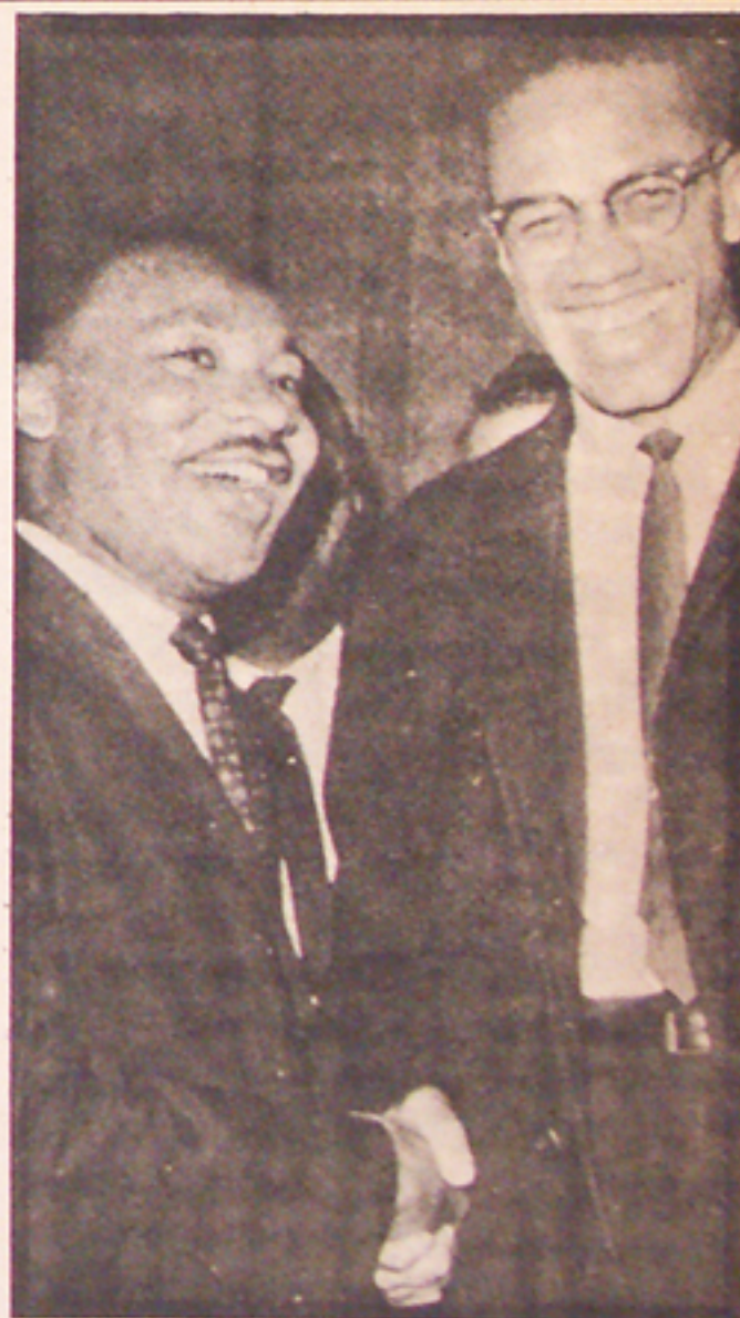
Dr. MARTIN LUTHER KING JR. (left) and MALCOLM X.

The heirs of Malcolm now stand millions strong on their corner of the triangle, facing the racist oppressor and the soulless endorsed spokesmen. The heirs of Malcolm are moving to expose the endorsed spokesmen so that the Black masses can see them for what they are and have always been. □