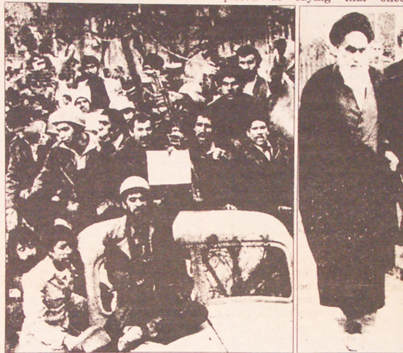
Iranian people celebrate the overthrow of the U.S.-backed Bakhtiar government following the return from exile of the leader of the Iranian revolution AYATOLLAH KHOMEINI (right).

A significant challenge to Khomeini and the Bazargan government has been mounted by Peoples Fedayeen, a Marxist group. The guerrilla group has been involved in numerous anti-government clashes in Tehran and throughout the country which have resulted in scores of deaths. □